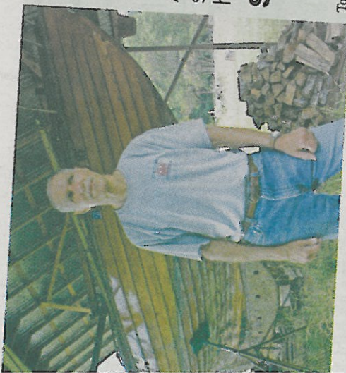
pl. 52, No. 27